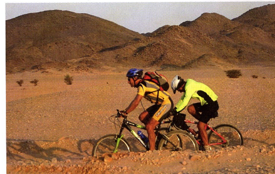
The Lushness of Africa. Riders pedal a variety of otherworldly landscapes in the Tour d'Afrique.

If you are a woman and interested in a woman-only cross-country tour in 2007, WomanTours offers the fully-supported Meandering Mississippi (north to south)